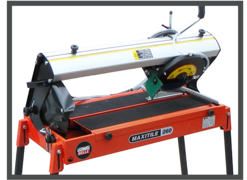
Adjustable Blade for Bevel Cutting