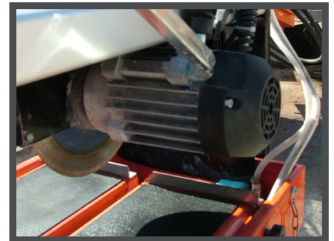
Robust Design for Trouble Free Operation